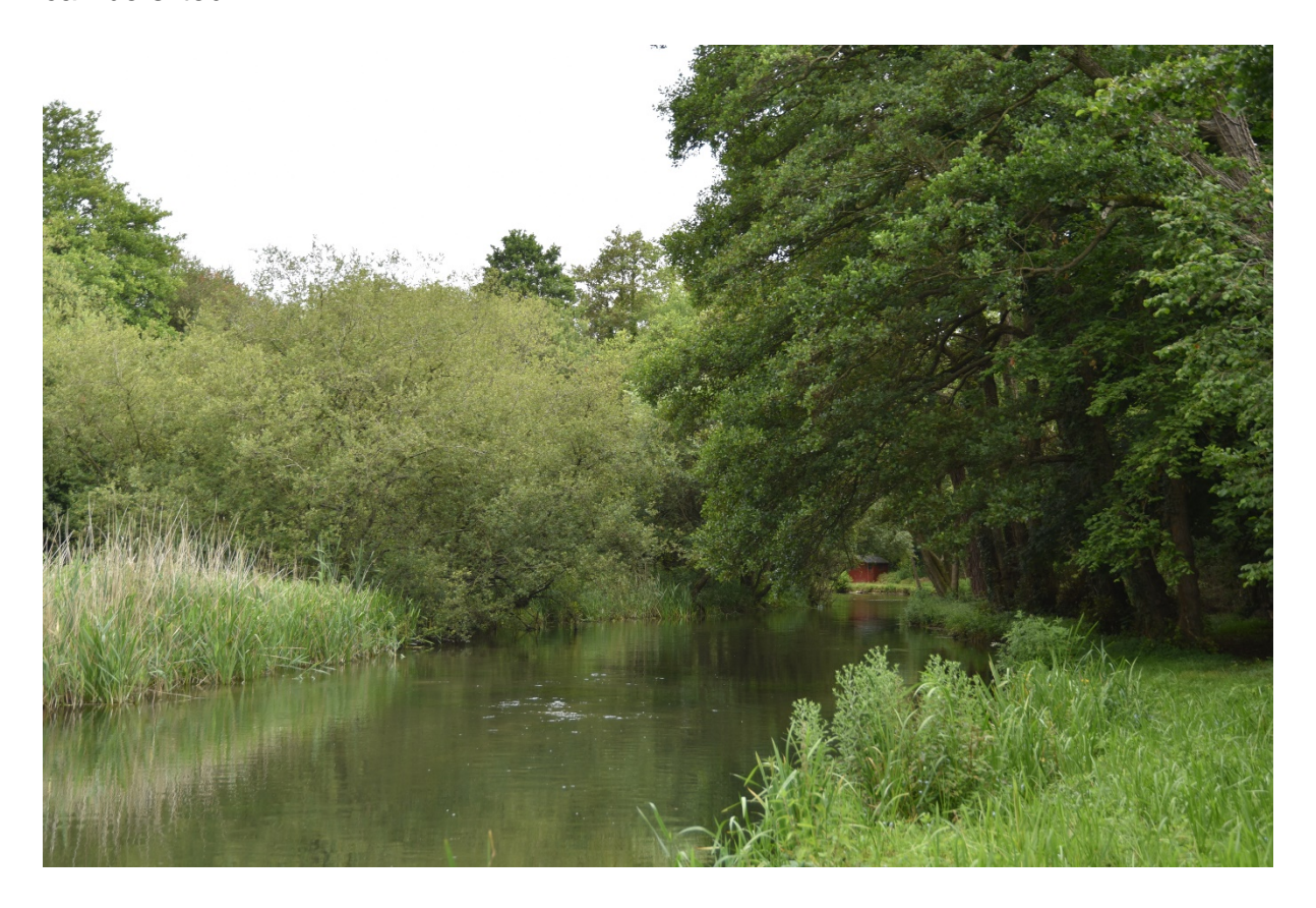
As you come into the hatch pool area the depth reduces considerably.

The river between here and tail of the hatch pool is the deepest section of the beat. Go carefully at all times, but especially during high water periods and where the tree roots have scoured deep holes. We recommend a flotation device at all times. The bottom can be silted.